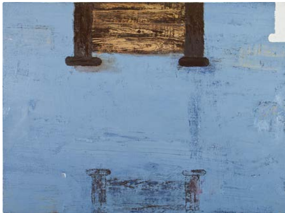
Sleep , Oil on Canvas