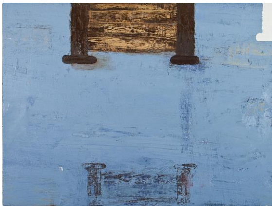
Sleep , Oil on Canvas